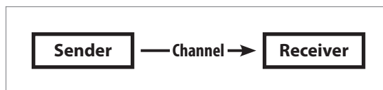
Figure 1. Shannon/Weaver transmission model of communication.

Figure 2 presents a much more basic model where sender becomes designer, channel becomes media, and receiver becomes reader. But in terms of an acknowledgement of